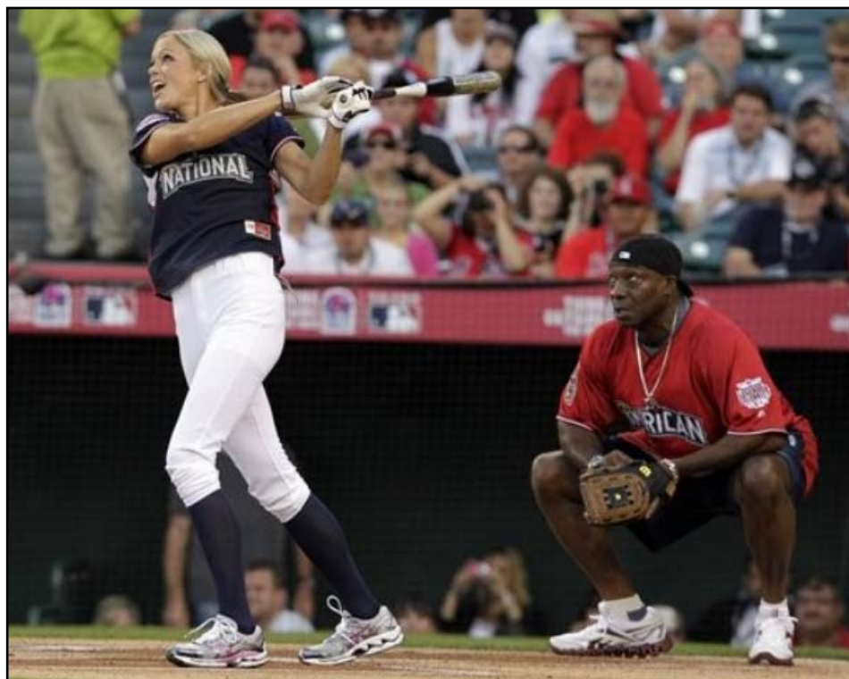
After becoming the first woman to hit a home run in the All-Star Legends & Celebrity softball game on Sunday in Anaheim, Calif., Olympic and World Champion Jennie Finch met with the finalists of the 2010 Aquafina Major League Baseball Pitch, Hit & Run, the "Official Youth Skills Competition of Major League Baseball" during MLB All-Star Week.

Finch (La Mirada, Calif.) and Watley (Irvine, Calif.) will attend the Pitch, Hit & Run (PHR) National Finals and will later recognize the champions during an on-field ceremony during the 2010 State Farm Home Run Derby on July 12. The top nationwide competitors (names listed below) from each age group (7-8, 9-10, 11-12 and 13-14) have advanced to the PHR National Finals. The PHR program invited youth to demonstrate their pitching, hitting and running abilities and all 30 MLB Clubs hosted competitions at their ballparks earlier this season. The addition of the Girls Softball Division gave young girls the opportunity to