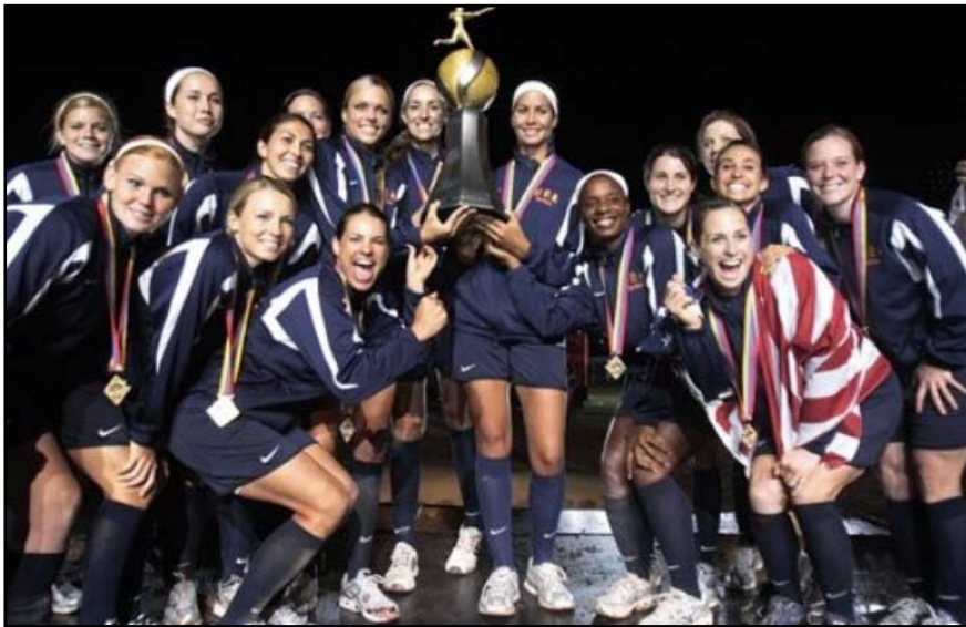
Members of the 2010 USA Softball Women's National Team stand on the podium July 2 at the Women's World Championship in Caracas, Venezuela, following a 7-0 victory over 2008 Olympic Champion Japan.

USA wins seventh consecutive Women's World Championship