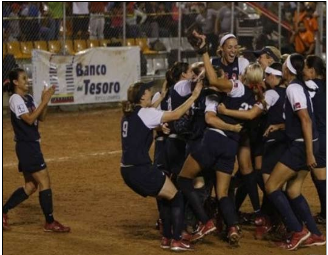
Team USA celebrates on the field after winning the 2010 Women's World Championship in Caracas, Venezuela, with a 7-0 victory over Japan, the 2008 Olympic Champions. USA, now the nine-time World Champions claimed their seventh-straight title, going undefeated, 10-0, and outscoring opponents 95-6.